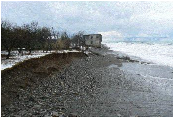
9 Coastal erosion at Adlia