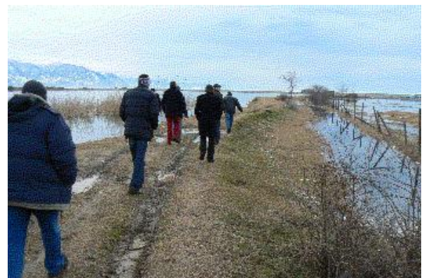
6 Wetlands in the river delta