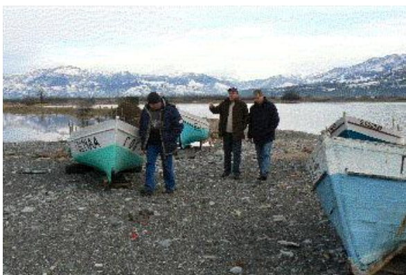
5 Wetlands in the river delta