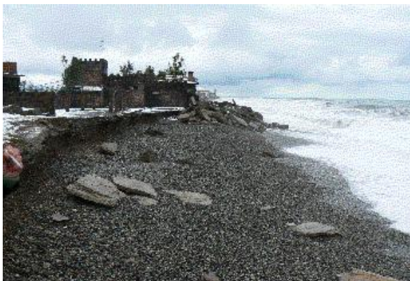
11 Protection of houses by deposit of construction waste