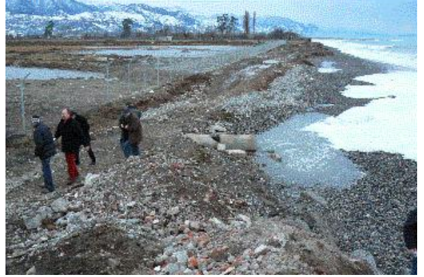
8 Erosion in the airport area