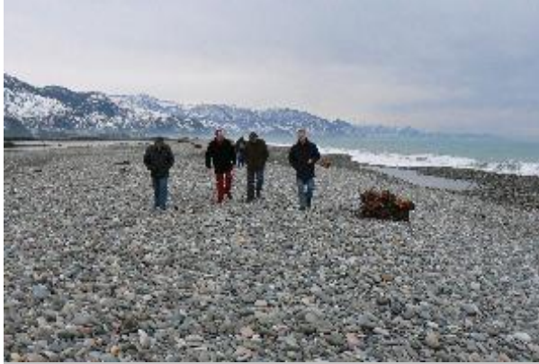
7 Natural coast at the river mouth