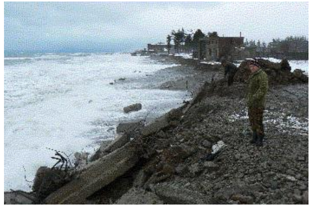
10 Coastal erosion at Adlia