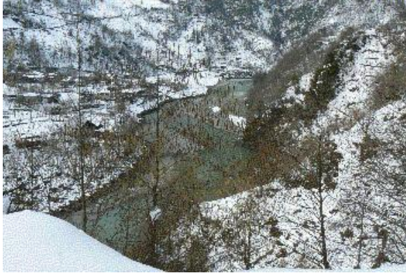
1 Chorokhi River close to Turkish border