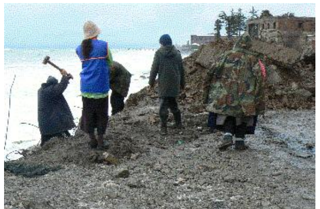
12 Protection of houses by deposit of construction waste