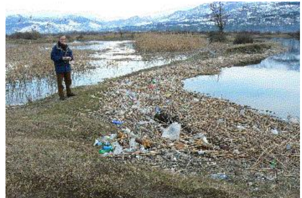
4 Chorokhi River, 2 km from river mouth