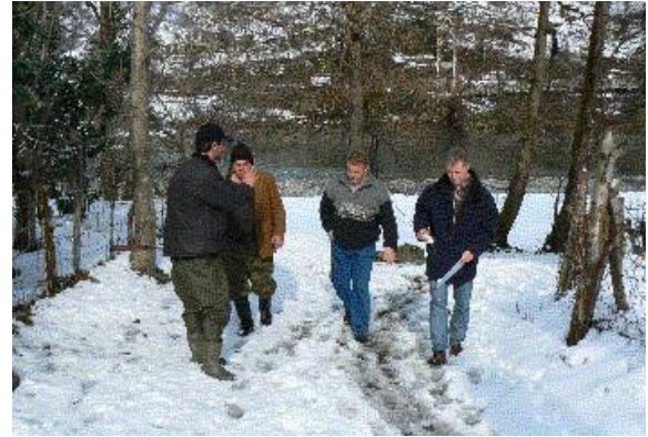
2 Talks with local inhabitants